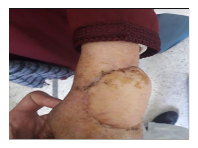
Figure 4 Clinical image of the flap 3 months later