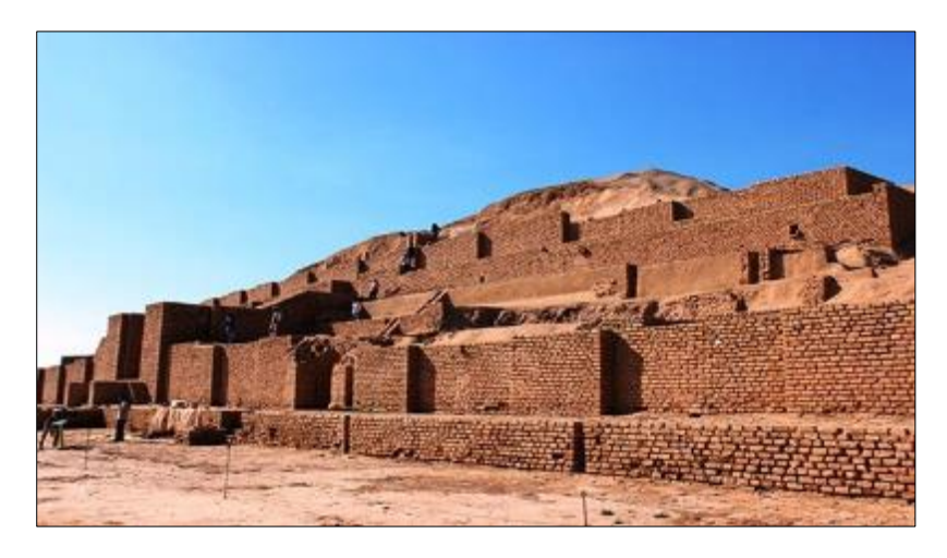
Figure 1 Ziggurat of Chogha Zanbil

Unfortunately, in recent decades, several restorations of this grand monument have taken place without re-evaluating the inscriptions engraved on those bricks. Furthermore, in earlier years when the Ziggurat of Chogha Zanbil lacked security, many valuable bricks from the structure were stolen, or they deteriorated due to the region's harsh winds, rains, and scorching sun. Nevertheless, significant efforts have been made in contemporary times to restore this site. In what follows, we will enumerate some of the architectural features of this structure, discuss the methods used in its restoration, and emphasize the necessity of considering ecological factors in the restoration of the Ziggurat of Chogha Zanbil (Figure 1).