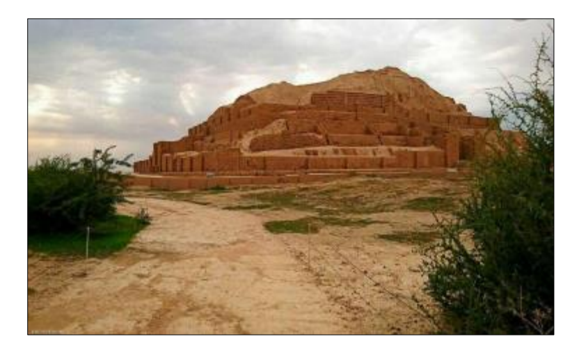
Figure 2 Vegetation Surrounding the Ziggurat of Chogha Zanbil

Additionally, despite the presence of environmental threats and the exacerbation of phenomena such as often unbalanced and unsustainable economic and social development, the area's wildlife exhibits remarkable diversity and serves as a vital ecological complement to the natural environment of the site; however, the increasing urbanization and associated risks—such as rising income inequality and concentrated knowledge complexity—further challenge the resilience of both local communities and ecosystems (Bevilacqua & Sohrabi, 2020), necessitating that city authorities address the challenges of each community achieving a green transition with more targeted programs based on its needs, while cities, public authorities, and private organizations respond to climate change with various green policies and strategies to enhance community resilience (Sohrabi et al., 2022; Talebzadeh et al., 2024).