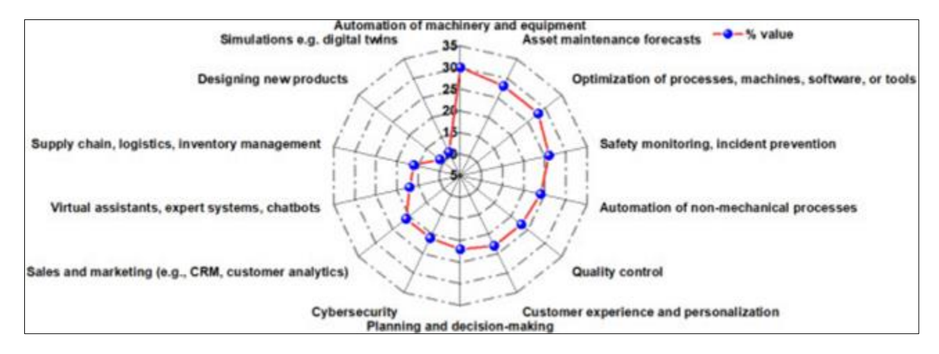
Figure 2 The use of AI (%) in different energy sectors (Ahmad, et. al., 2020)

plant. These sensors continuously gather a wide range of data, including temperature, pressure, flow rates, and energy output (Bassey & Ibegbulam, 2023, Mathew, 2023, Zhang et al., 2021). AI algorithms process this vast amount of data to provide actionable insights and facilitate informed decision-making. For instance, machine learning models can analyze historical and real-time data to detect patterns, identify anomalies, and predict potential equipment failures (Liu et al., 2020, Nwachukwu, et. al., 2023). This predictive capability allows operators to take pre-emptive actions, such as adjusting operational parameters or scheduling maintenance, before issues escalate into costly problems. The use of AI (%) in different energy sectors presented by Ahmad, et. al., 2020 is as shown in Figure 2.