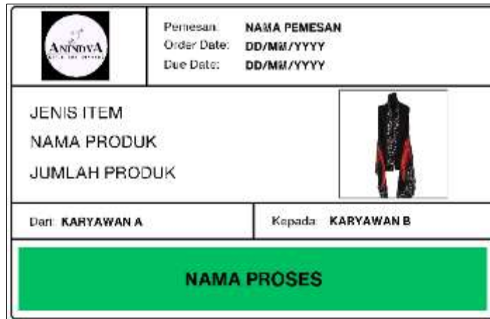
Figure 1 Design of Kanban Production Card

Because there are 4 processes in production at QRS Batik SME, there are 4 colors that represent each process identity. Green represents completed tasks, red indicates the sewing process, yellow signifies the cutting and measuring process, and blue denotes the design process. In addition to the use of production kanban, a kanban board is also used which consists of 4 parts, namely, To Do, In Progress, Done, and Approved as illustrated in Figure 2.