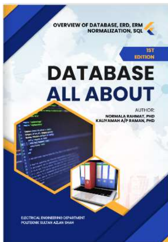
Figure 1 Front Page of the eBook 'Database All About'.

A study by Kim et al. (2021) found that digital resources that offer consistency and clarity, along with user-friendly features, are particularly beneficial in helping students perform better academically, especially in fields that involve technical or abstract subjects like database management [3].