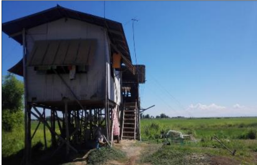
Figure 2 An example of a house made from light materials and yet still surviving the flood

Labor cost was so minimal then because bayanihan was practiced among the villager. According to majority of the respondents, almost all of the laborers who built their house were free of charge, usually kin and family members are the usual workers to build the house. In cases that they are not family, they are still free of charge and don't have any compensation at all. The locals call this " batares ". The usual compensation is food and snacks during working hours, and later concluded a day of work by an " inuman " or a drinking session.