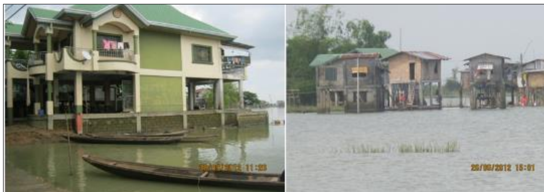
Figure 1 Stilt houses of San Agustin slightly submerge to floodwaters