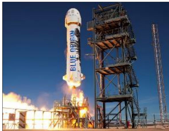
Figure 4 Use of composites in the space and rocket industry

Since many properties of composite materials differ greatly from those of metals, they have gained importance compared to metal materials. The low specific gravity of composites provides a great advantage in light constructions. In addition, the corrosion resistance of fiber-reinforced composite materials and their heat, sound and electrical insulation provide an advantage for the relevant areas of use.