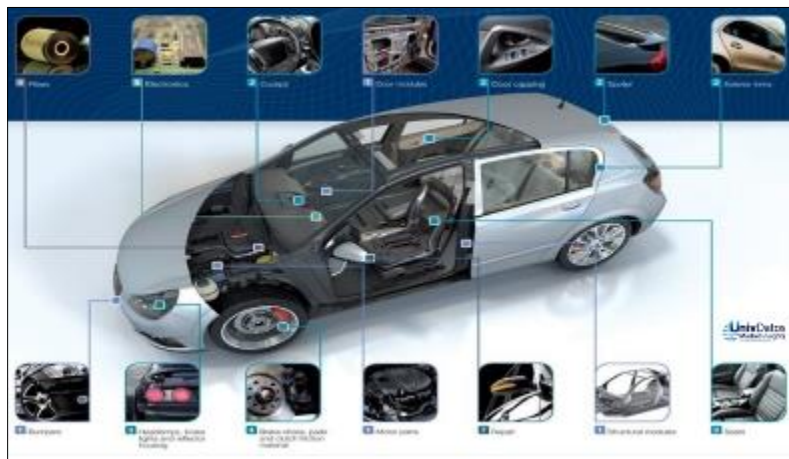
Figure 2 Use of composites in the automotive industry