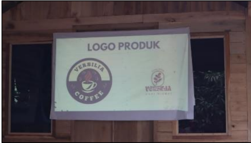
Figure 2 Logo-making activities and benefits of IPR registration

Figure 2 shows a training activity that focused on product logo creation and the benefits of registering Intellectual Property Rights (IPR). The materials presented aimed to increase coffee farmers' understanding, particularly in Karang Sidemen Village, of the importance of logos as a branding element that reflects their local product identity. A well-designed logo serves not only as a visual symbol but also as a strategy to build a stronger brand image in the market, both nationally and internationally.