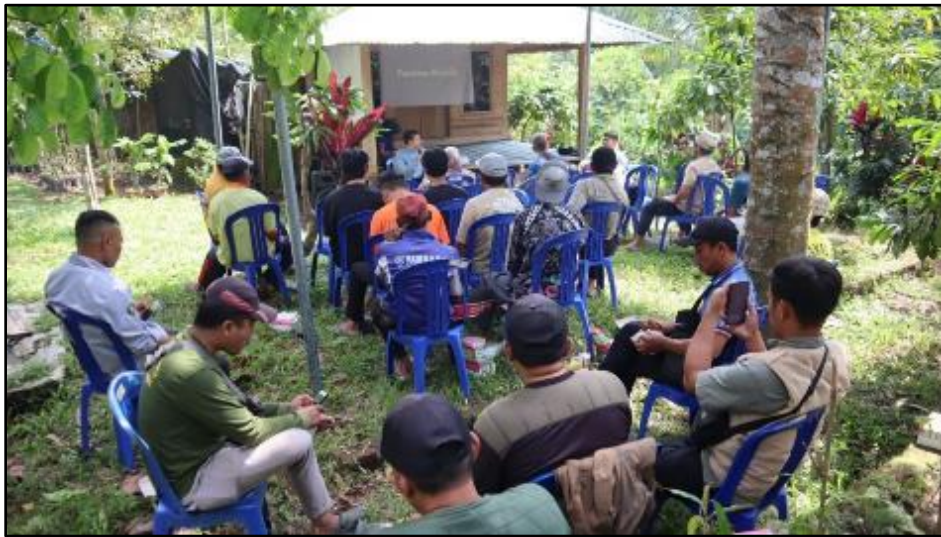
Figure 1 Data collection activities with in-depth Interviews with farmer groups to obtain qualitative data

In addition, observation data during the training showed that the assistance from the implementation team greatly helped farmers understand the administrative process. Farmers became more confident after intensive training in logo design, document filing, and the use of the online registration system. Analysis of the training documents also showed that the systematic steps provided by the training team succeeded in overcoming most of the technical obstacles faced by farmers.