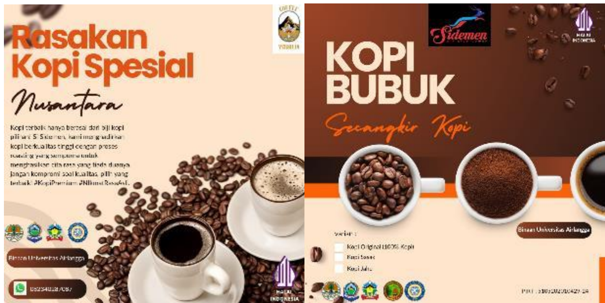
Figure 4 Product packaging sticker design for Sidemen and Virsilia logos of coffee farmer groups

Figure 4 shows the coffee product packaging sticker designs developed for two local coffee brands: Sidemen and Versilia, innovated by farmer groups in Karang Sidemen Village. The designs combine modern visual elements with a strong local identity to strengthen branding and product appeal in national and international markets.