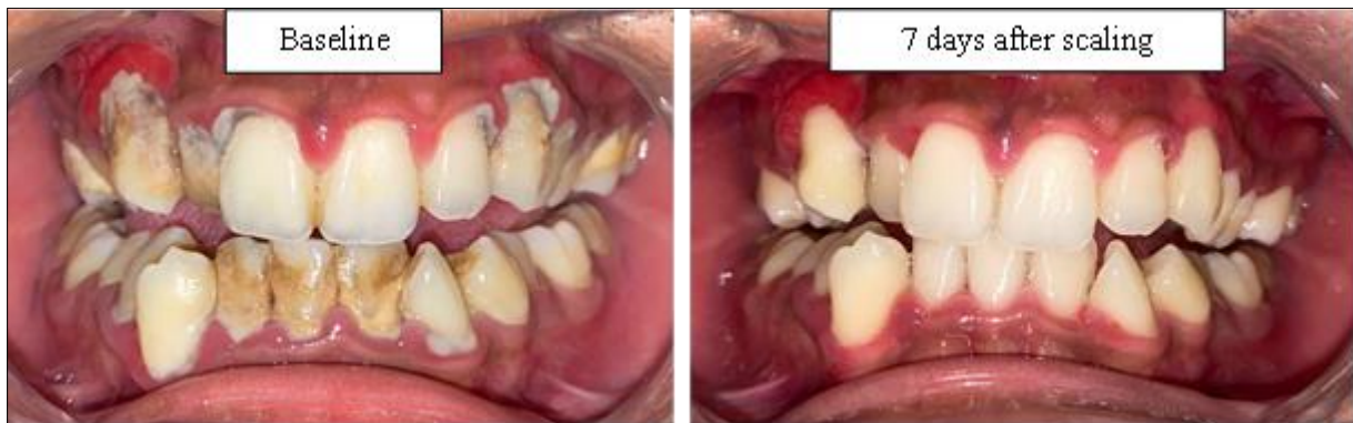
Figure 2 Patients aged 30 years with moderate gingivitis score on the baseline and after the use of mouthwash after seven days become mild gingivitis score