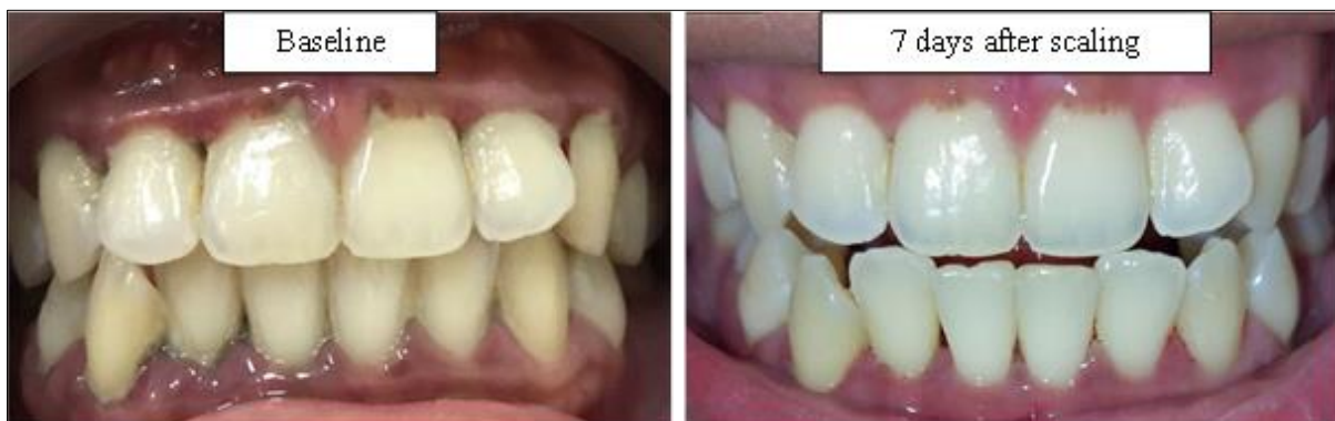
Figure 3 Patients aged 21 years with a score of severe gingivitis on the baseline and after the use of mouthwash after seven days became moderate gingivitis